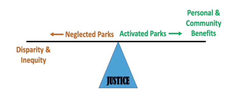
Figure ES2 Parks and the fulcrum of justice

Most barriers disproportionately impacted children: Of those who report bringing children to parks, 70% reported bathroom conditions were a barrier to using parks, compared to 44% of other participants; 64% reported maintenance issues as a barrier compared to 51% of others; and 52% reported safety as a barrier compared to 42%. Further, participants bringing children to parks were twice as likely to report unsafe routes. Given the developmental and life-long positive impacts of transformative childhood experiences in parks, these barriers have far-reaching ramifications.